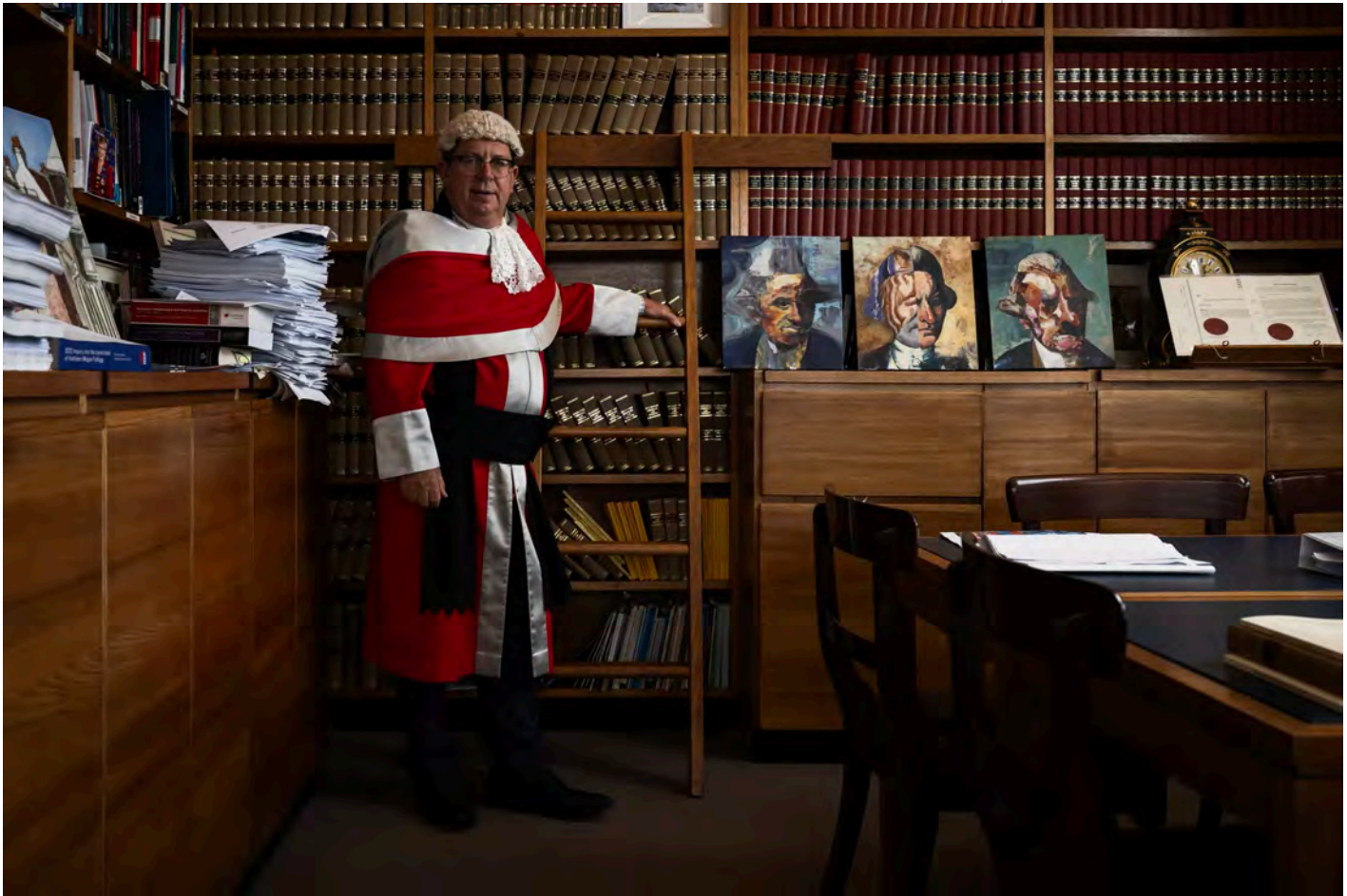
Chief Justice Andrew Bell in his chambers in Sydney.

in its defence back in 2012 said it could “only be hoped that if the building survives another 50 years then the original design may be appreciated”. It will need all the time it can get.