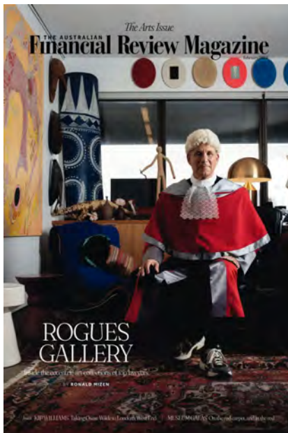
This feature appears in the Arts issue of AFR Magazine out on February 2.

“His passion for art was well known,” he wrote. “To describe his enormous collection as eclectic understates both its importance and diversity: paintings, drawings, prints, sculpture, ancient and contemporary ceramics, coins and items of antiquity; Australian, European, Chinese, Japanese and Pacific Islander. In his later years, after visiting the outback for the first time, he developed an interest in Aboriginal art. It was a revelation to him.”